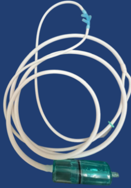
Hydrogen and Oxygen Inhalation Tube