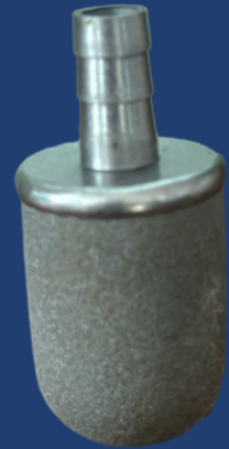
Stainless Steel Diffuser

Package includes 4 inhalation tubes and 2 SS diffusers with certified machine with warranty