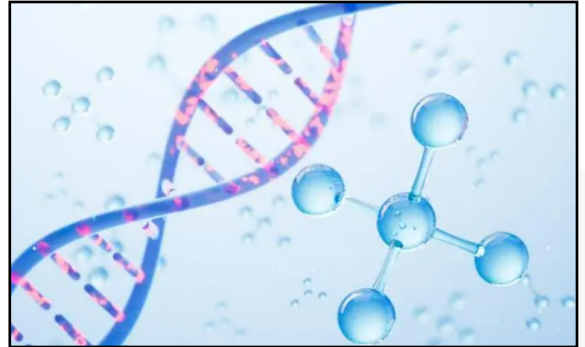
Slows down free radical damage