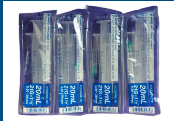
20 CC latex free syringes