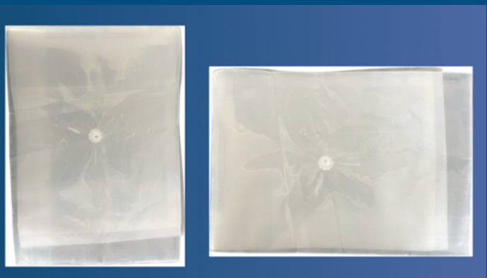
ozone wound bags