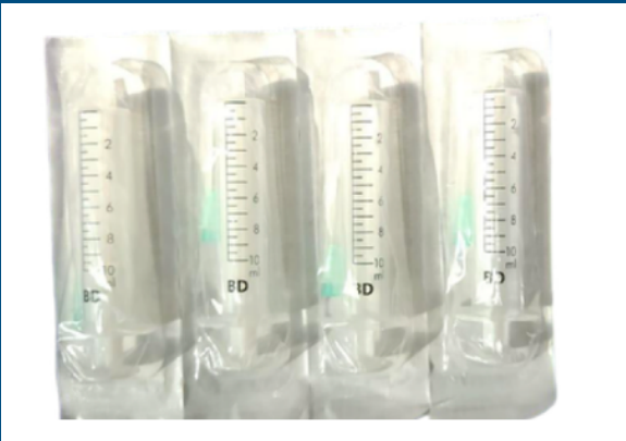
10 CC latex free syringes