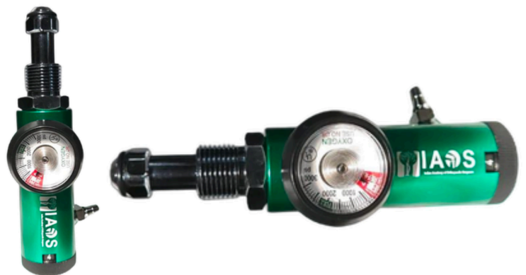
Special regulator with up to 1/32 of litre regulator