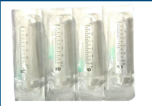
10 CC latex free syringes