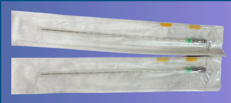
250 mm long needles for intradiskal ozone