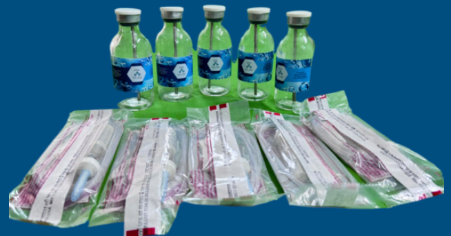
MAHT Vacuum bottles with special transfusion sets