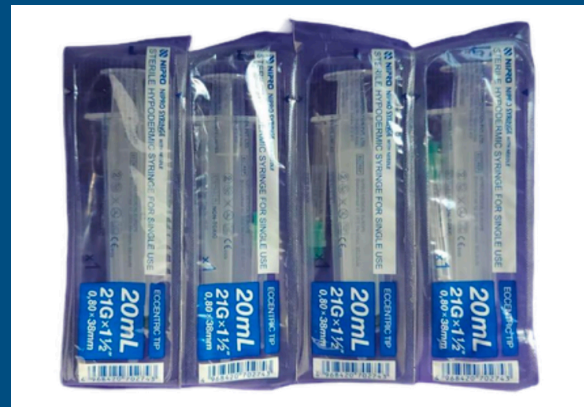
20 CC latex free syringes