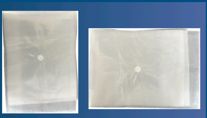
ozone wound bags