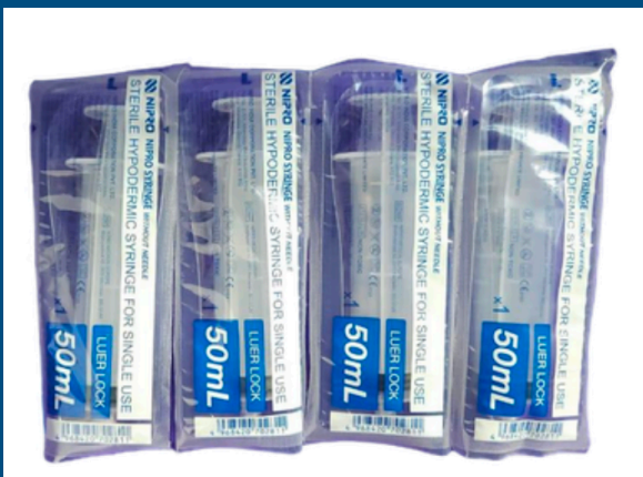
50 CC latex free syringes